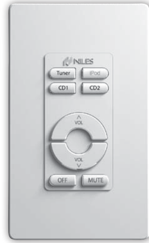
SOLO-4 IR KEYPAD WEATHER-RESISTANT KEYPAD FOR THE ZR-4 MULTIZONE RECEIVER